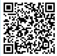
Scan QR code to access online