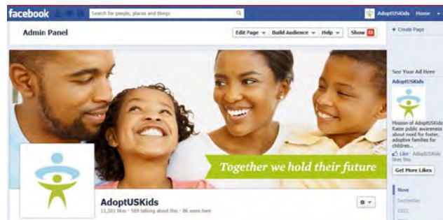
Figure 1. AdoptUSKids' cover photo includes our tagline, "Together we hold their future"