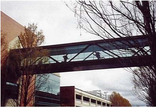
Illustration 1. A sky-bridge is an enclosed horizontal passageway spanning from one building to another building that allows persons to walk from one building to a neighboring building without exiting either building.