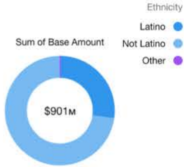
Approved Funding by Ethnicity