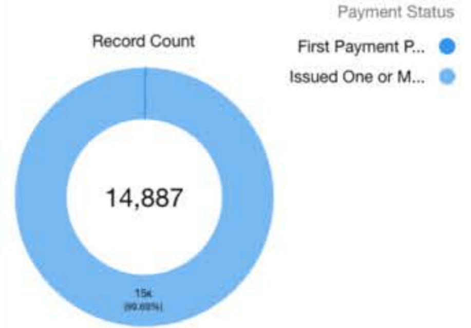
Approved by Payment Status