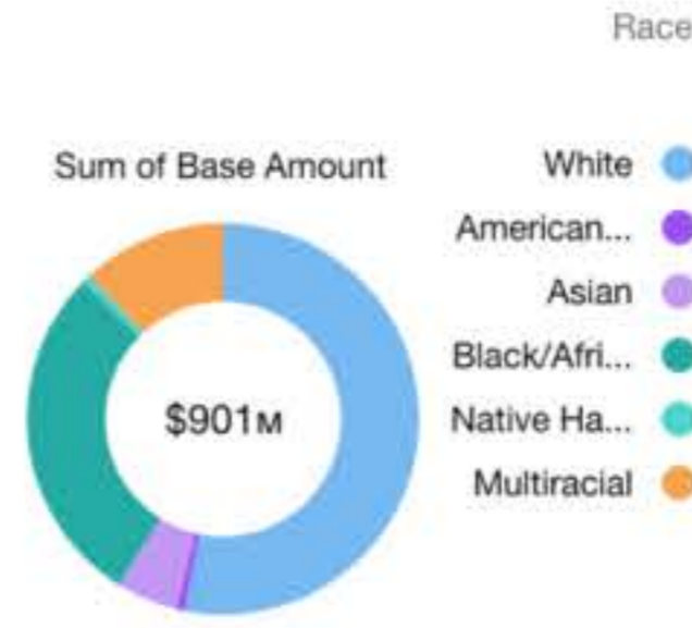
Approved Funding by Race