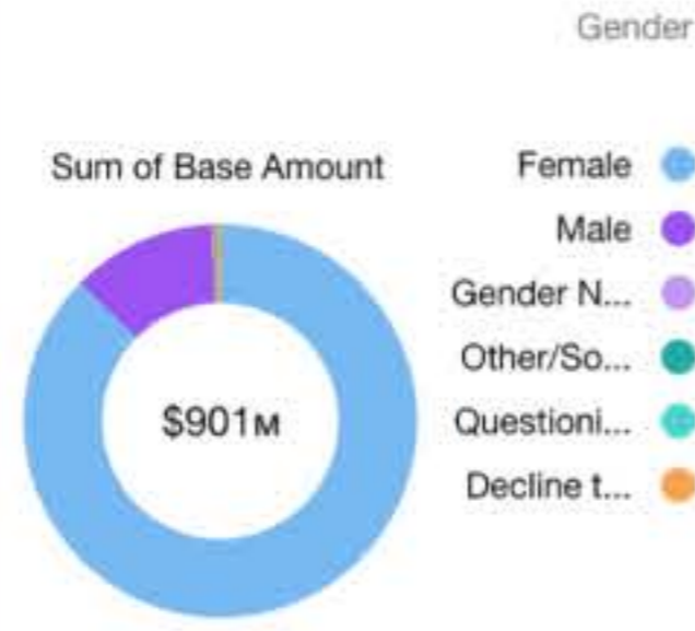
Approved Funding by Gender